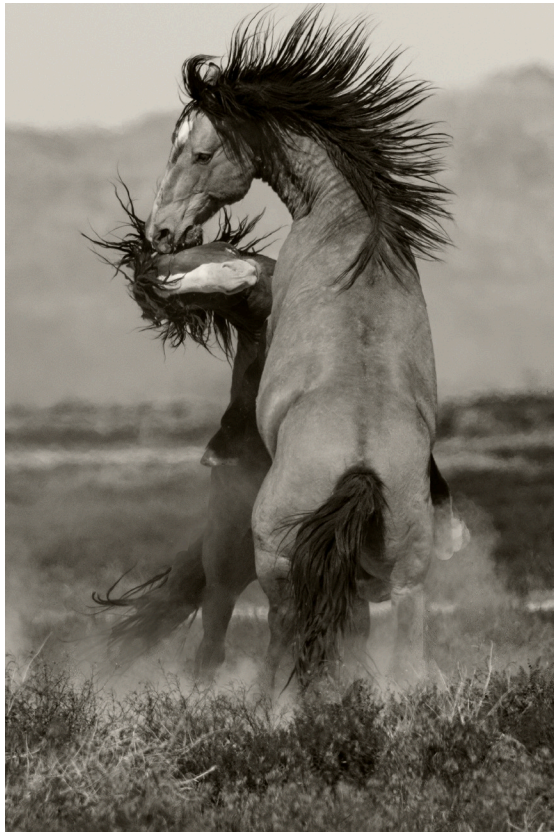
Carole Waterhouse, Discussion , 2022 Digital photograph on archival paper, 9" x 6"

Linda Noonan Peonie with Sideman, 2023 Pastel on paper, 20" x 28"