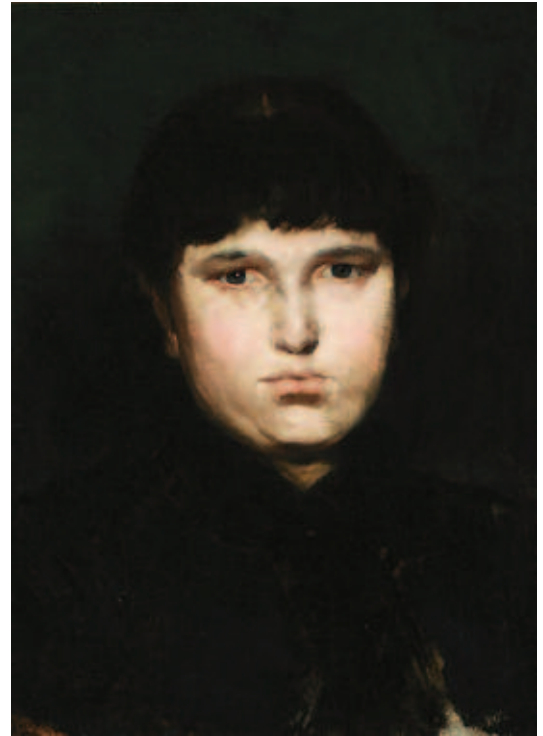
Mary Cassatt (American, 1844 – 1926) The Somber One , 1872 Oil on canvas, 14 3/4" x 18" Gift of the Frank and Margaret Sullivan Fund

"Into Thy Hands I Commend My Spirit" (#6 from The Seven Last Words of Christ ), 1898 Platinum print, limited archival edition, printed c. 1997, 18/100, 6 3/8" x 4 5/8" Gift of the Frank and Margaret Sullivan Fund