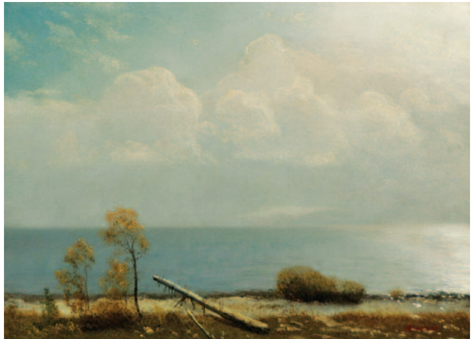
Albert Bierstadt (American, b. Germany, 1830 – 1902)

Gift of the Frank and Margaret Sullivan Fund