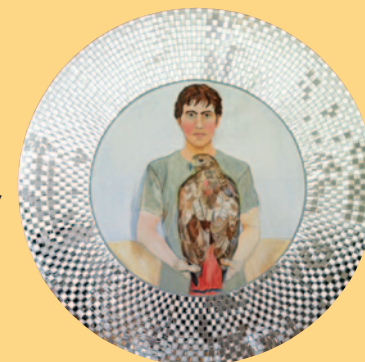
Guardian , 2014-15