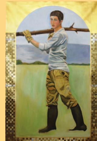
Branch , 2012-14

Wanderer Drawing , 2014-15 Pencil on vellum, 42" x 20" Private collection