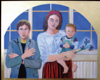
Night Light , 2012-14