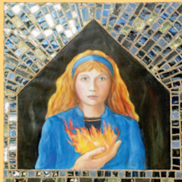
My Fire , 2010

Guardian , 2014-15 Oil on canvas, metallized film and metallic lamé, 63" dia. Private collection