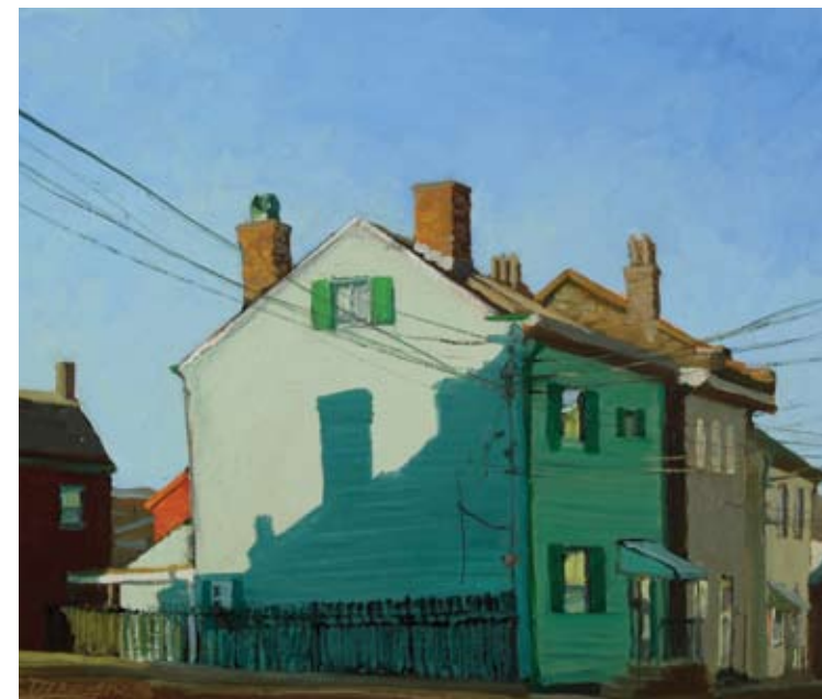
Ron Donoughe, House Shadow , 2009

No Outlet , 2008 Oil on panel, 9" x 12" Collection of the artist