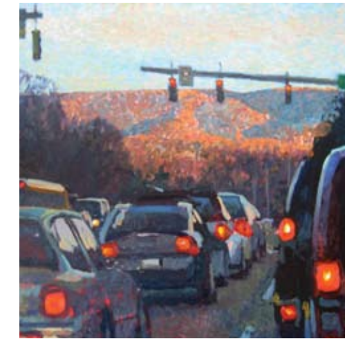
Kevin Kutz, Heading for the Hills , 2009

Stanislaw Winter Vista , 2008 Oil on panel, 9" x 12" Private collection