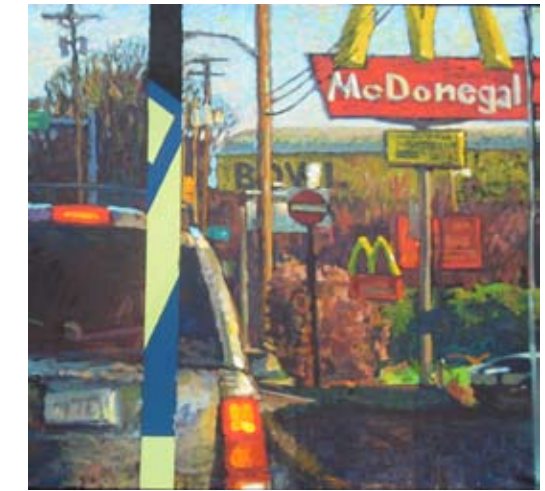
Kevin Kutz, Heading Home , 2009

Steel Day , 2006 Oil on panel, 11" x 14"